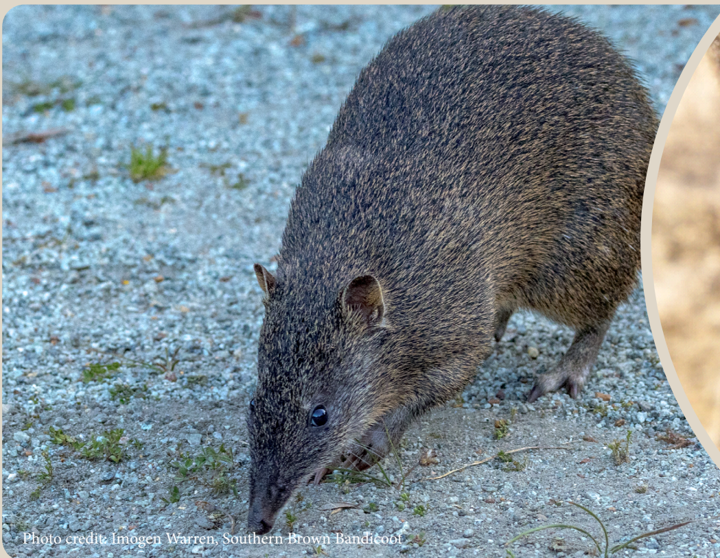
Southern Brown Bandicoot